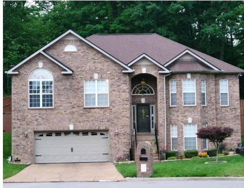
May: 1012 Pinot Chase