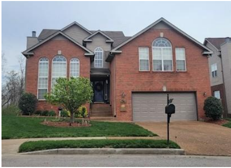
April: 5508 Oak Chase Drive

Congratulations to the first three Yards of the Month of 2025! We appreciate these residents for their hard work in maintaining an attractive property and uplifting the appearance of the entire community.