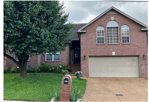
June: 5241 Ridgefalls Way

Each time a home is awarded the “Yard of the Month” honor, they get a $50 gift card. Could yours be among the next? Of course it could! Keep that lawn trimmed and green, those flowerbeds colorful and weed-free, those trees groomed, and your home exterior clean (call Under Pressure 615 to help that). To nominate a neighbor for the honor, drop a line to ohdvcommunity@gmail.com with the home address.